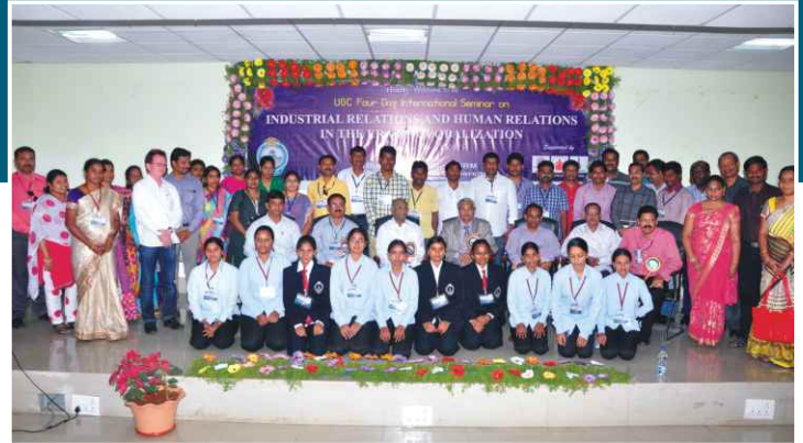
A group photo with Dignitaries, Alumni, Scholars and Students