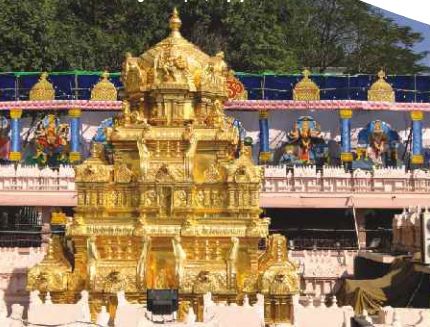
Goddess Durga Temple, Vijayawada