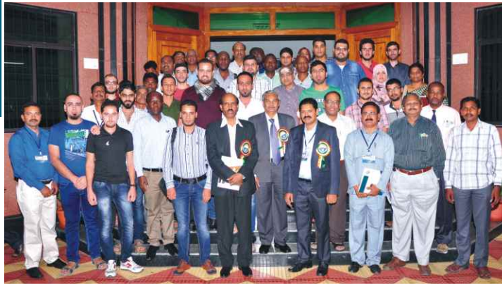
A group photo with Dignitaries, Foreign Scholars and Participants